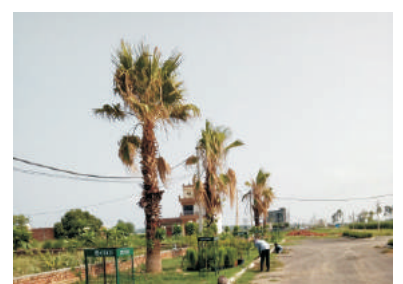
Trees growing healthily at new location