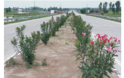
Shrubs growing healthily