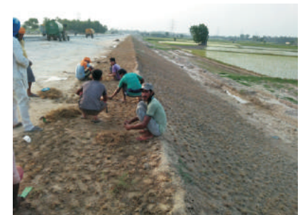
Grading of slopes using Machinery and Manual labour