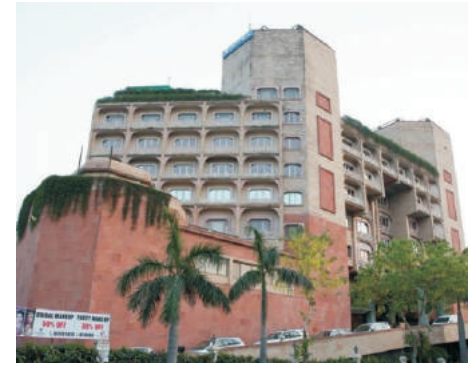
Park Plaza (Ludhiana) Landscaping