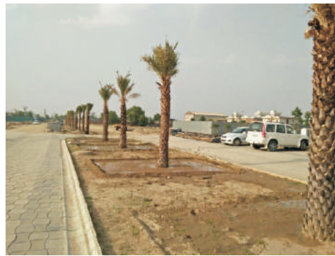
Central verge planted with Date palms