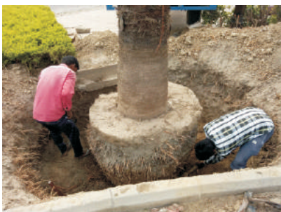
Root and stem pruning of tree to be transplanted