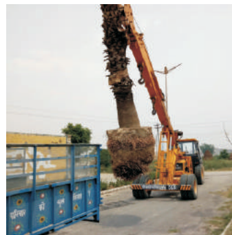
After hardening the pruned tree, moving it to new location for replanting