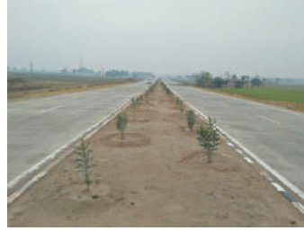
Planting of shrubs