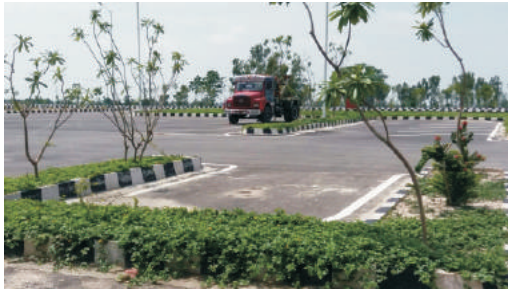
Plants growing healthily in Parking area