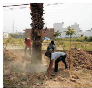
Replanting at new location