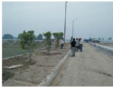
Pitting and planting