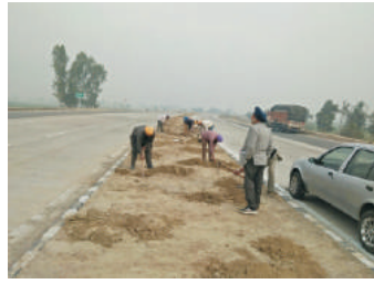
Soil filling and digging of pits