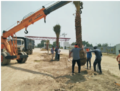
Planting works at Industrial park at Amritsar