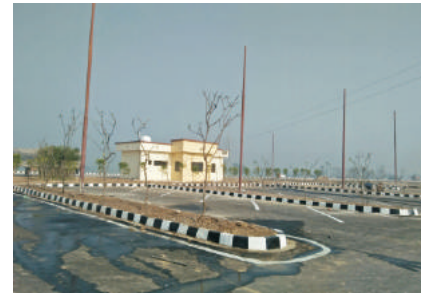
Completion of planting works