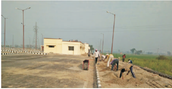
Drivers Restrooms area on NH-15