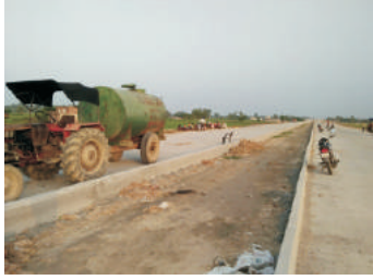
Central verge on NH-15